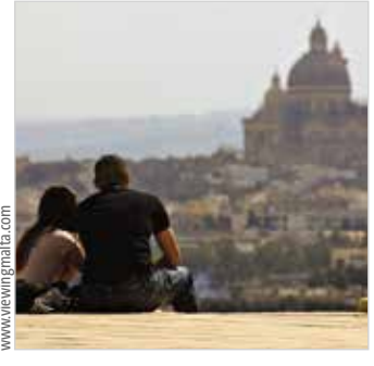
The island's towns are quiet and peaceful. Enjoy an aromatic cup of coffee, glass of local wine or pint of beer at the quaint cafés in the town's piazzas.