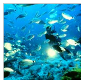
Explore the underwater world of the Mediterranean. Gozo's coastline has inlets and coves filled with crystal clear waters, making Gozo ideal for diving.