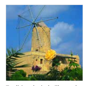
Traditional windmills are the feature of the countryside.

2.5 hours using ferry and taxi, around EUR 60