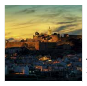
Visit the citadel, the medieval capital of Gozo, and discover island's turbulent past.