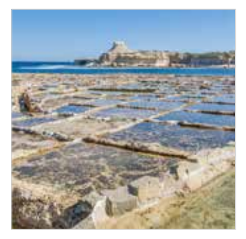
The production of sea salt is a tradition in Gozo and the saltpans found near Marsalforn are still used today.